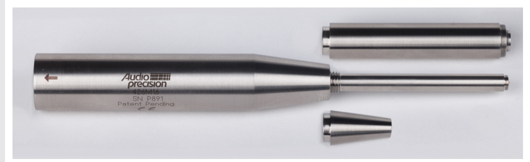
426M16 preamplifier components, which can be assembled for use with either ½" or ¼" mic cartridges.

With the 376M03 microphone system, we are introducing the 426M16: a flexible, phantom-powered preamplifier that can mount either \frac{1}{2} " or \frac{1}{4} " standard IEC 61094-4 prepolarized microphone cartridges.